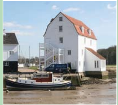
Traditional Suffolk weatherboard planking on the renovated tide mill