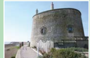
The Martello tower marks the western side of the entrance